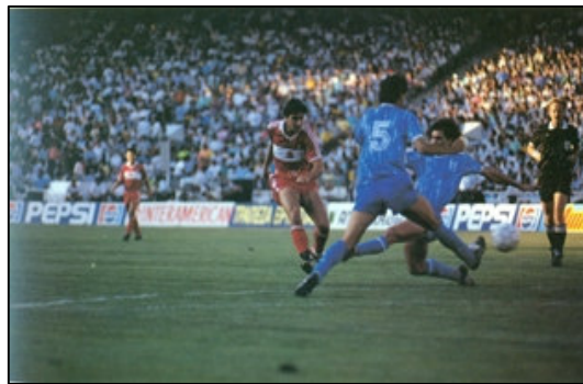
Finale de football Grèce-Turquie