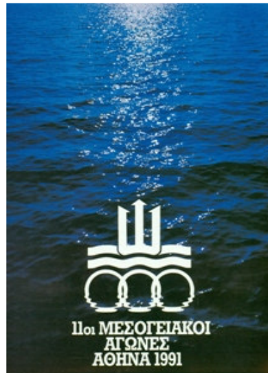
Affiche officielle des JM d'Athènes 1991