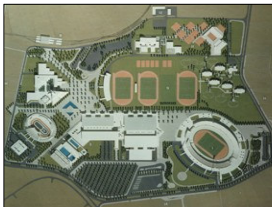
Plan du Complexe Olympique d'Athènes