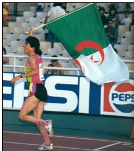
L'algérienne Hassiba Boulmerka s'offre un tour après sa victoire aux 1500m et aux 800m