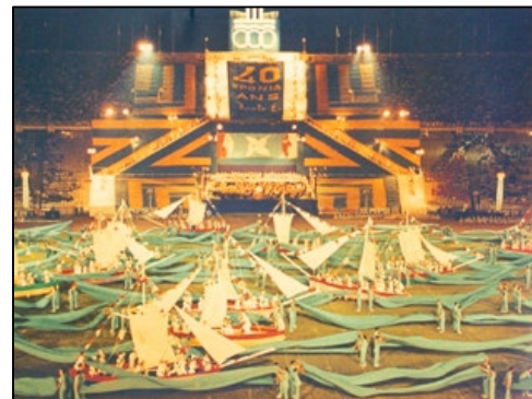
Vue de la cérémonie d'ouverture