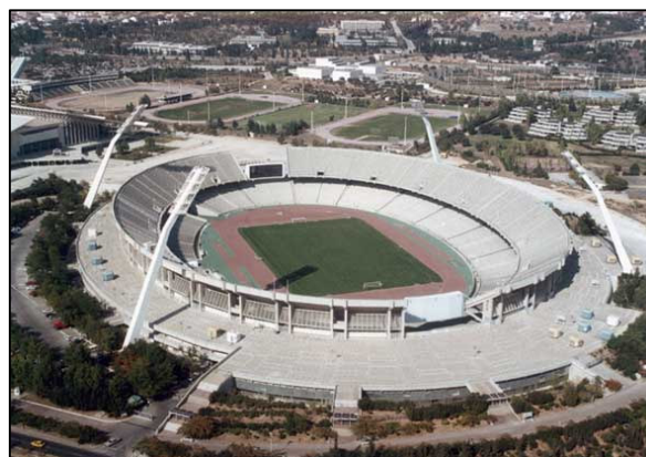
Le Stade Olympique d'Athènes